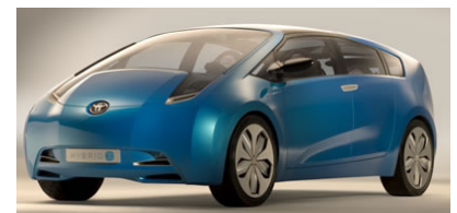
TOYOTA HYBRID X CONCEPT

When Prius launched in the U.S. in 2000, the national gas price was about a buck. Now with gas prices in flux, Prius makes perfect sense for today's market. There's one more reason why the Prius is so much more successful than other hybrids, and that's because it looks like a hybrid. Many people don't want a conventional hybrid with only tiny badges announcing to the world that they save gas; they want a four wheeled rolling statement of frugality. With the FT-HS sports car concept at the Detroit Auto Show or the Hybrid X unveiled at the Geneva Auto Show in 2007, Toyota appears to have a strong grasp on that philosophy. The Hybrid X takes the design language of the Prius to a new extreme and is, without a doubt, a hybrid.